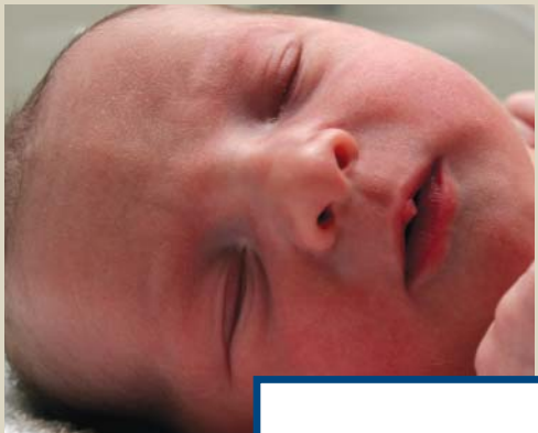
Birth of a child