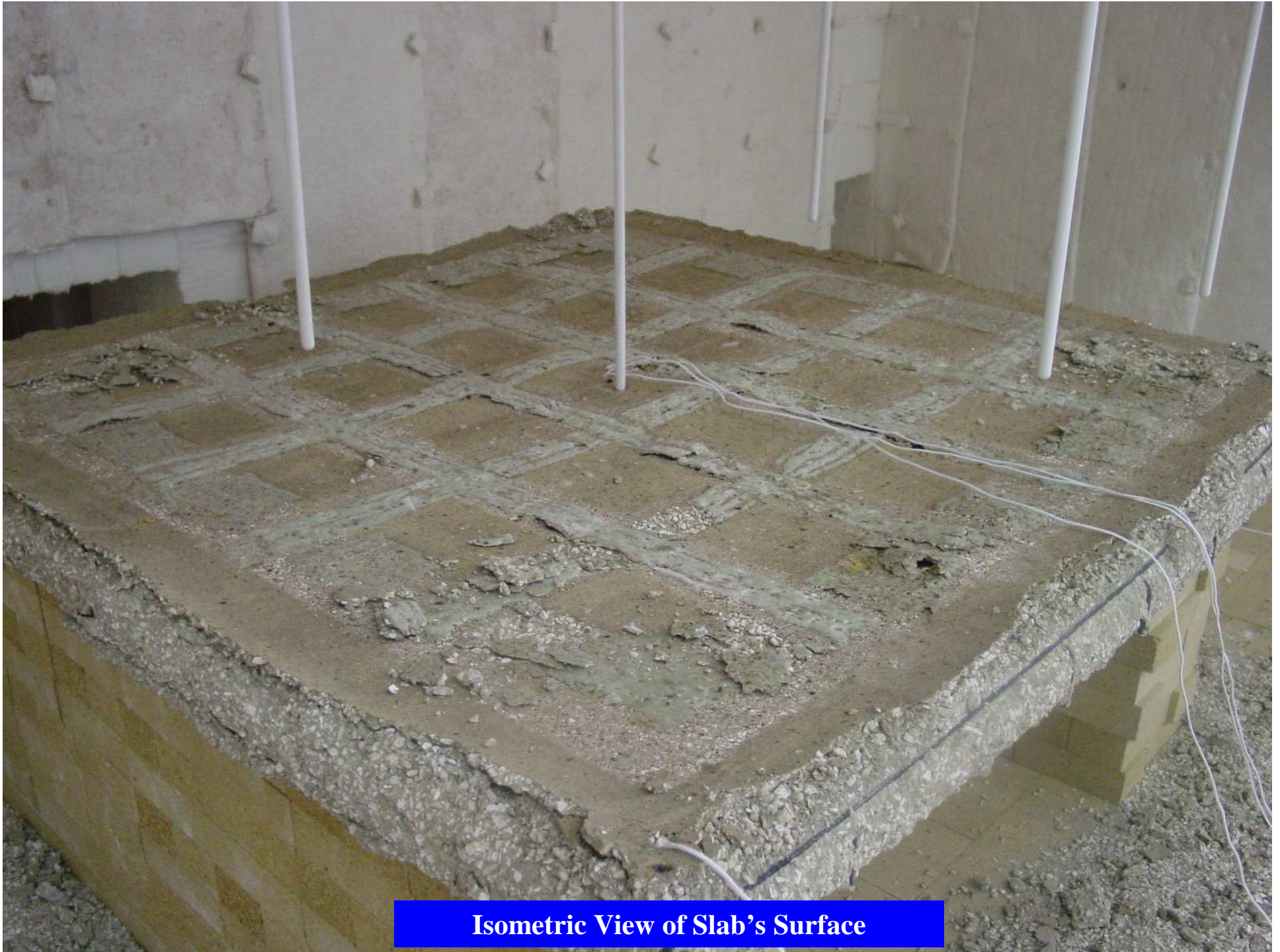
Isometric View of Slab's Surface