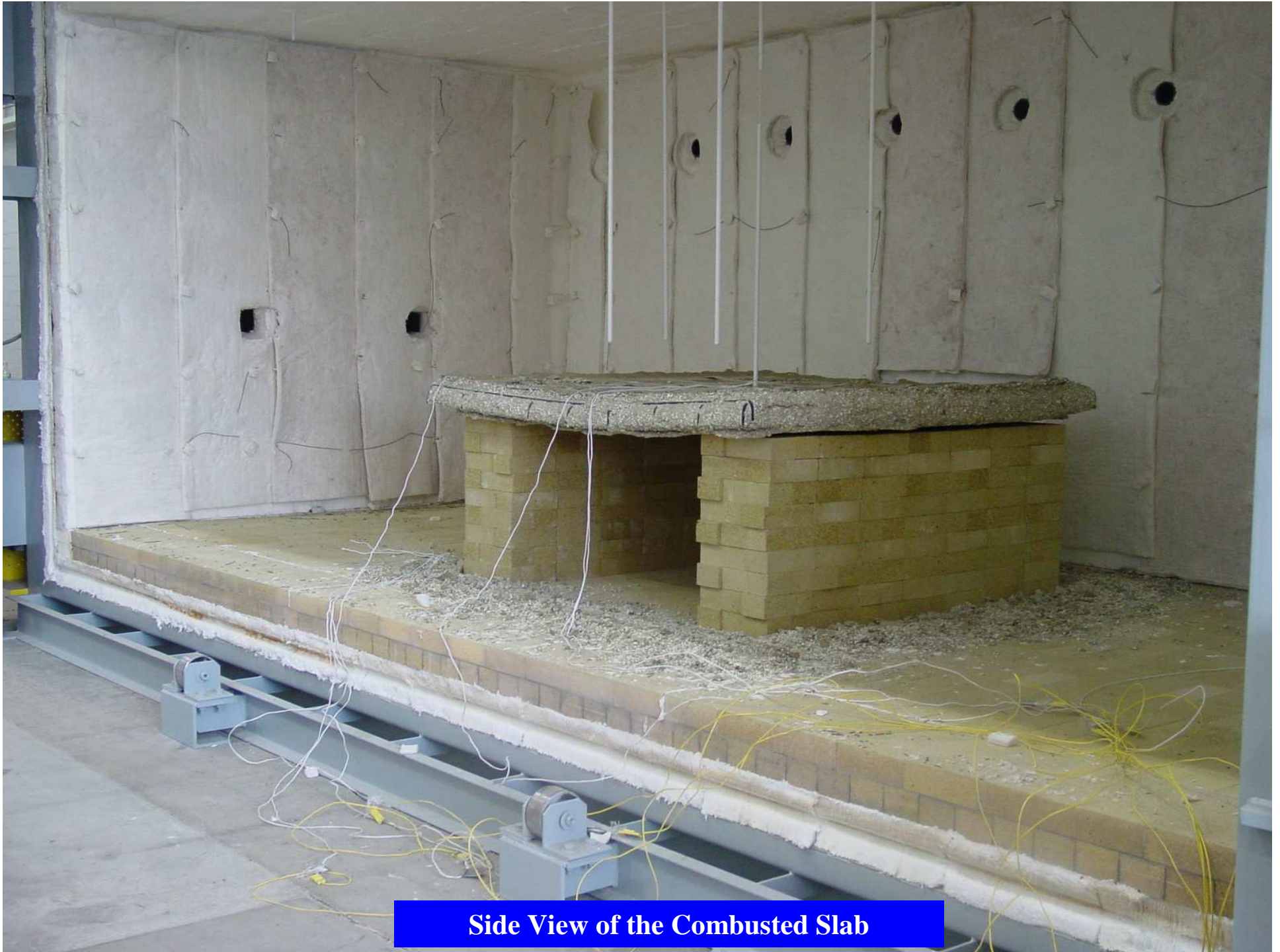
Side View of the Combusted Slab