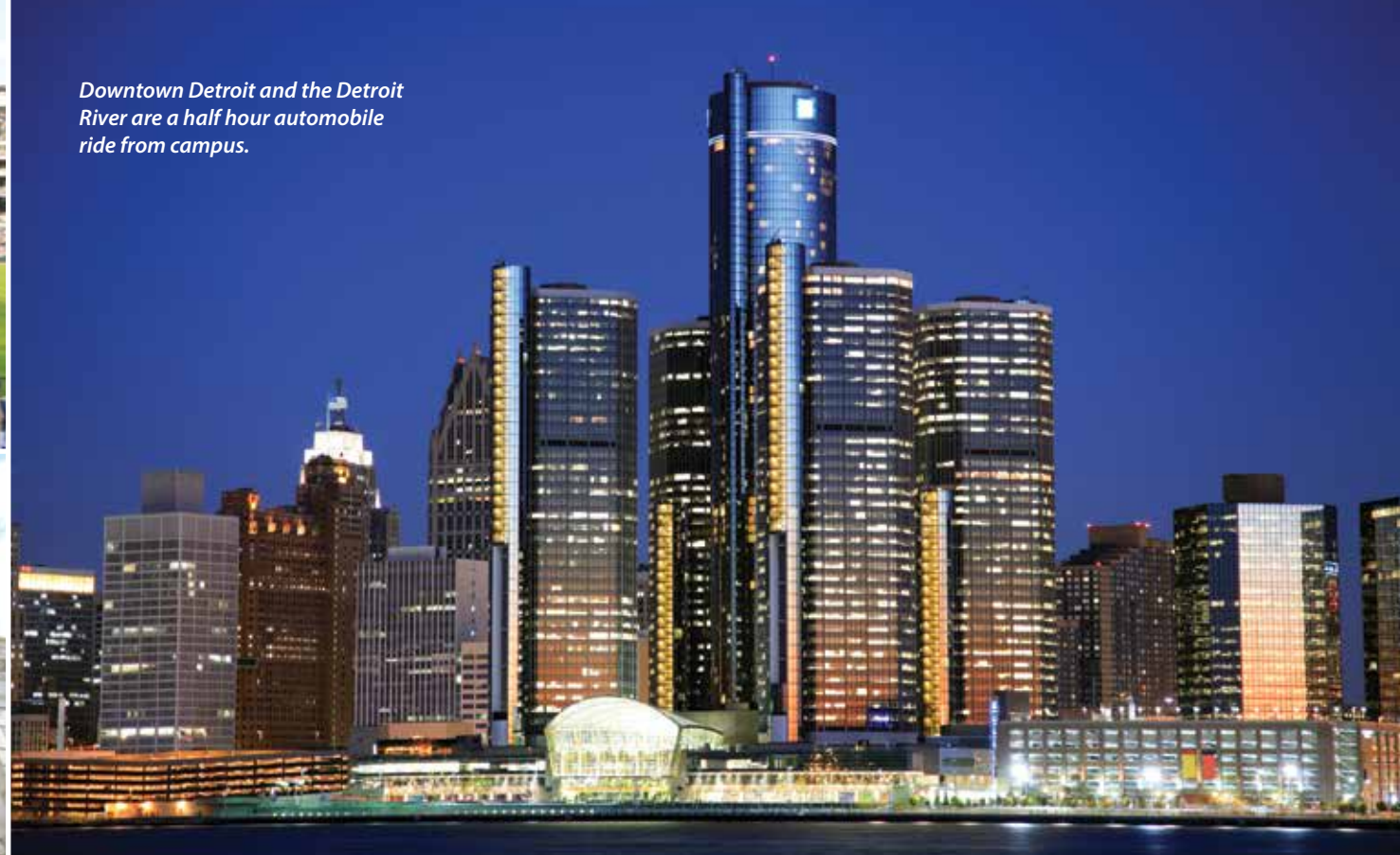
Downtown Detroit and the Detroit River are a half hour automobile ride from campus.